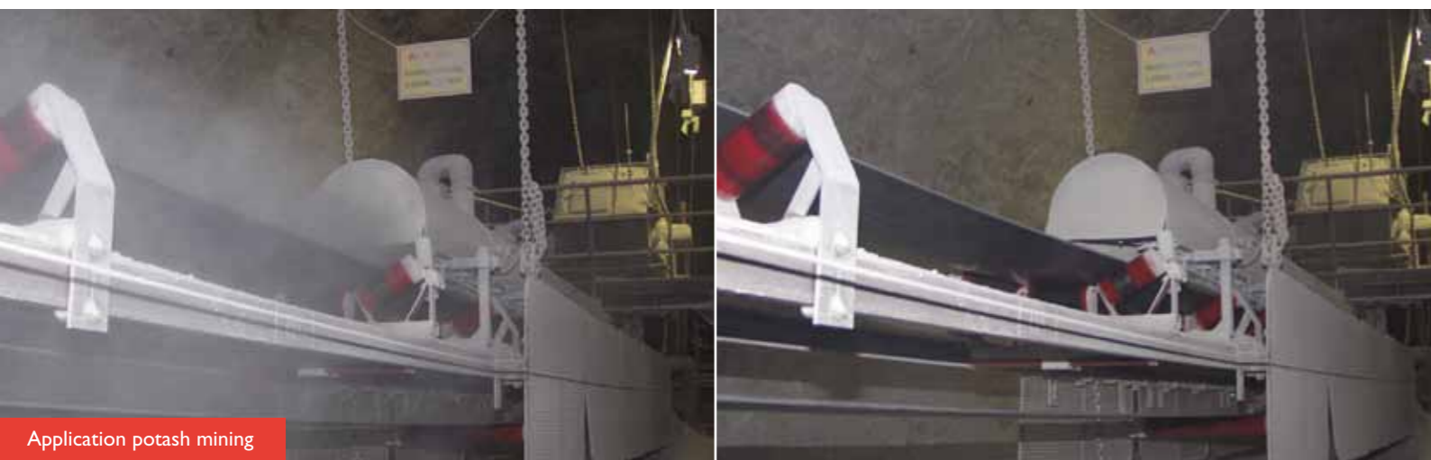
Application potash mining