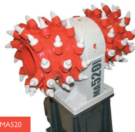
Sandvik Cutting Attachment MA520