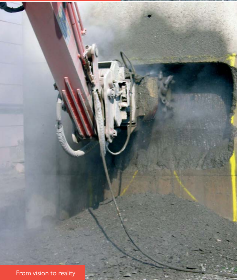
From vision to reality